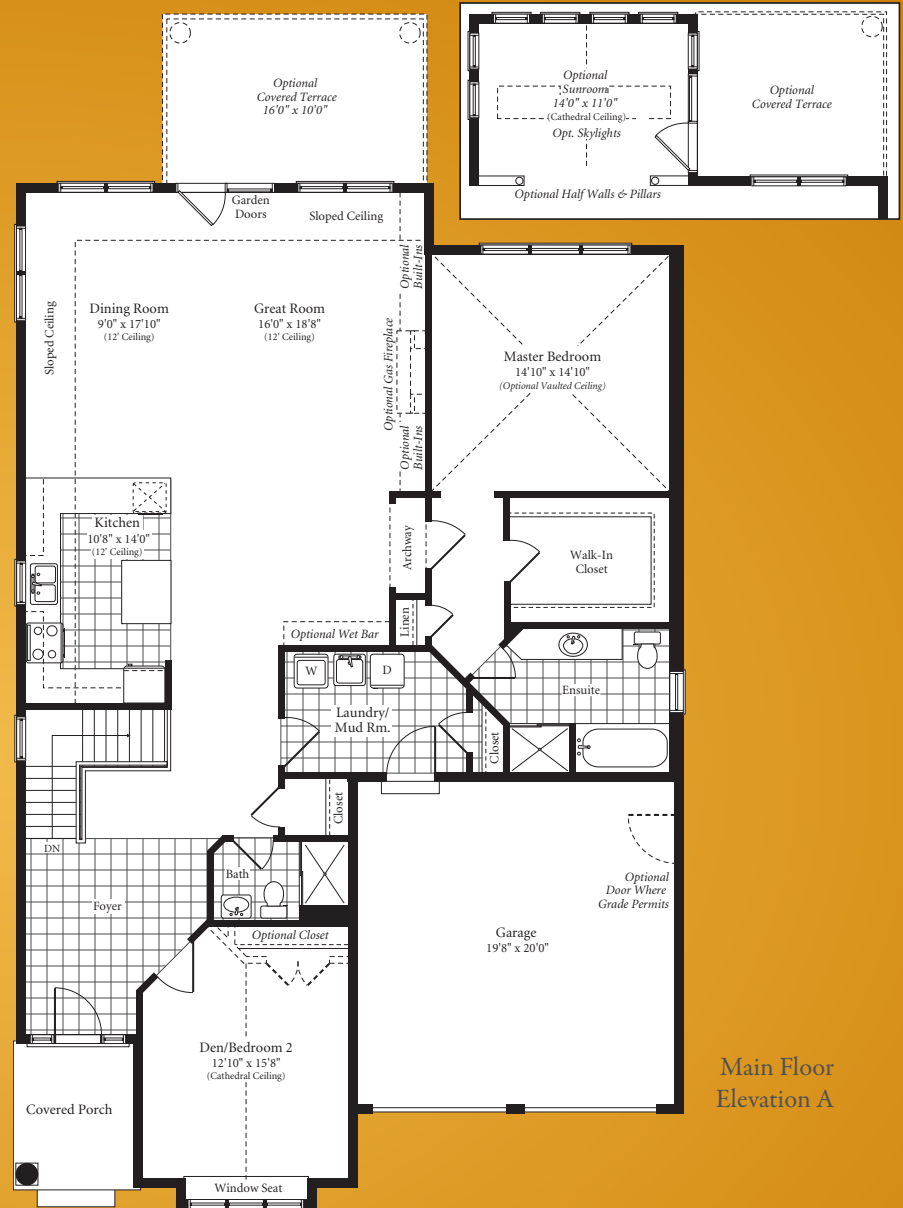
Main Floor Elevation A

All dimensions are approximate and generally comprise the greater width by the greater length. Actual useable floor area may vary from that stated, which includes open areas and areas finished below grade where applicable. Elevation renderings are Artist's Concepts and may vary according to floor plan configurations. See Sales Representative for details. E & OE.